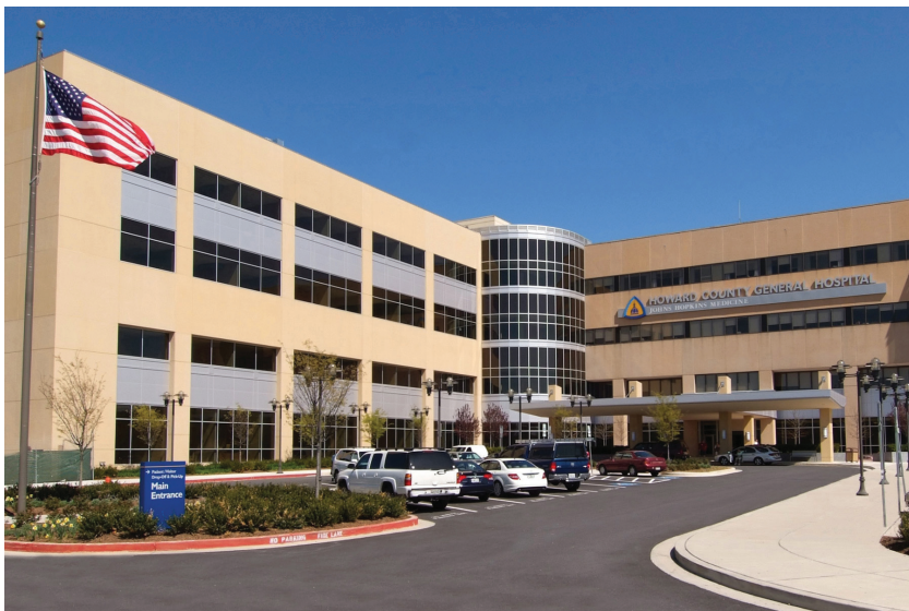
The Village in Howard created a mutually beneficial relationship with Howard County General Hospital, the Office on Aging and Independence and the Howard County Local Health Improvement Coalition.

TVIH's Healthy Aging Workgroup has used this template in its outreach efforts with the OAI and HCLHIC. Members represent TVIH on various committees and these organizations provide classes and healthy aging programs either directly at TVIH's office or in a county location. They have also become a host organization for the county's effort to complete and submit into the hospital database advance directives of the population. This is a collaborative relationship with the county hospital where both organizations benefit!